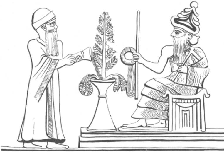
Othmar Keel, The Symbolism of the Biblical World: Ancient Near Eastern Iconography and the Book of Psalms , 135.

Mesopotamia developed a motif that a divine tree existed and was protected by the gods. Below you can see a carving from Nimrud, showing goats around a tree of life and symbolizing its vitality. There's also cherubim, showing that it is the domain of the gods.